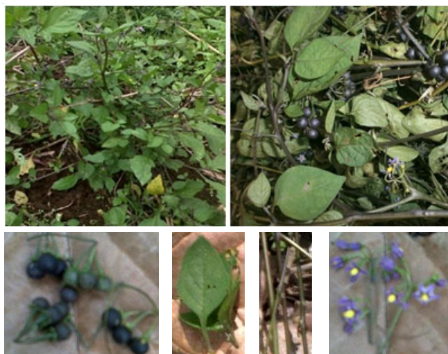
Fig. 1. Plant of Solanum blumei Ness ex Blume and section fruits, leaf, and branches flowers

The fruits of S. blumei were collected from Kuta Nangka village, sub-district Tanah Pinem, Dairi, North Sumatera Province, Indonesia (Fig. 1). Identification of plant material was carried out at the Herbarium Bogoriensis, Indonesian Institute of Sciences (LIPI) Cibinong, Indonesia, where the herbarium voucher has been kept.